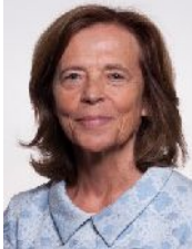
Ms Margarida MARQUES Vice-Chair, Committee on European Affairs PS - S&D