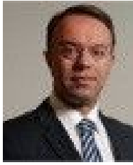
Mr Christos STAIKOURAS Committee on Economic Affairs New Democracy - EPP