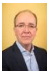
Mr John LAHART Committee on Budget Oversight Fianna Fáil - ALDE