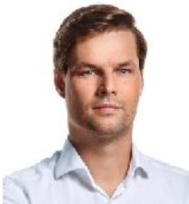
Mr Kalle PALLING Committee on EU Affairs Eesti Reformierakond - ALDE