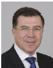
Mr Domagoj Ivan MILOŠEVIĆ Chair, Committee on European Affairs Croatian Democratic Union - EPP