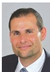
Mr Robert ABELA Chair, Committee on Public Accounts Partit Laborista - S&D