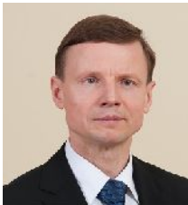
Mr Aivar SÕERD Committee on Finance Reform Party - ALDE