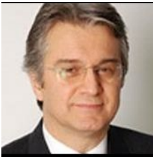
Mr Bülent KUŞOĞLU

Justice and Development Party (AKP) - No group affiliation in the EP