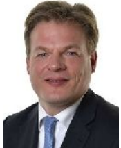
Mr Pieter OMTZIGT Committee on European Affairs CDA - EPP