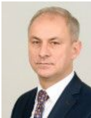
Mr Grzegorz NAPIERALSKI

Vice-Chair, Committee on Family, Senior and Social Policy Prawo i Sprawiedliwość - ECR