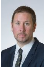
Mr Paavo ARHINMÄKI Grand Committee Left Alliance - GUE/NGL